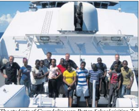
The students of Gwendoline van Putten School visiting Zr. Ms. Zeeland.

The return trip from Zeeland to Statia Harbour by very fast boats was considered almost more impressive by the students and teachers than the excursion itself.